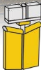
Propeller for Swine Barns