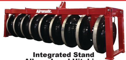
Integrated Stand Allows Level Hitching

Standard equipped with a cat. 3N/3 hitch